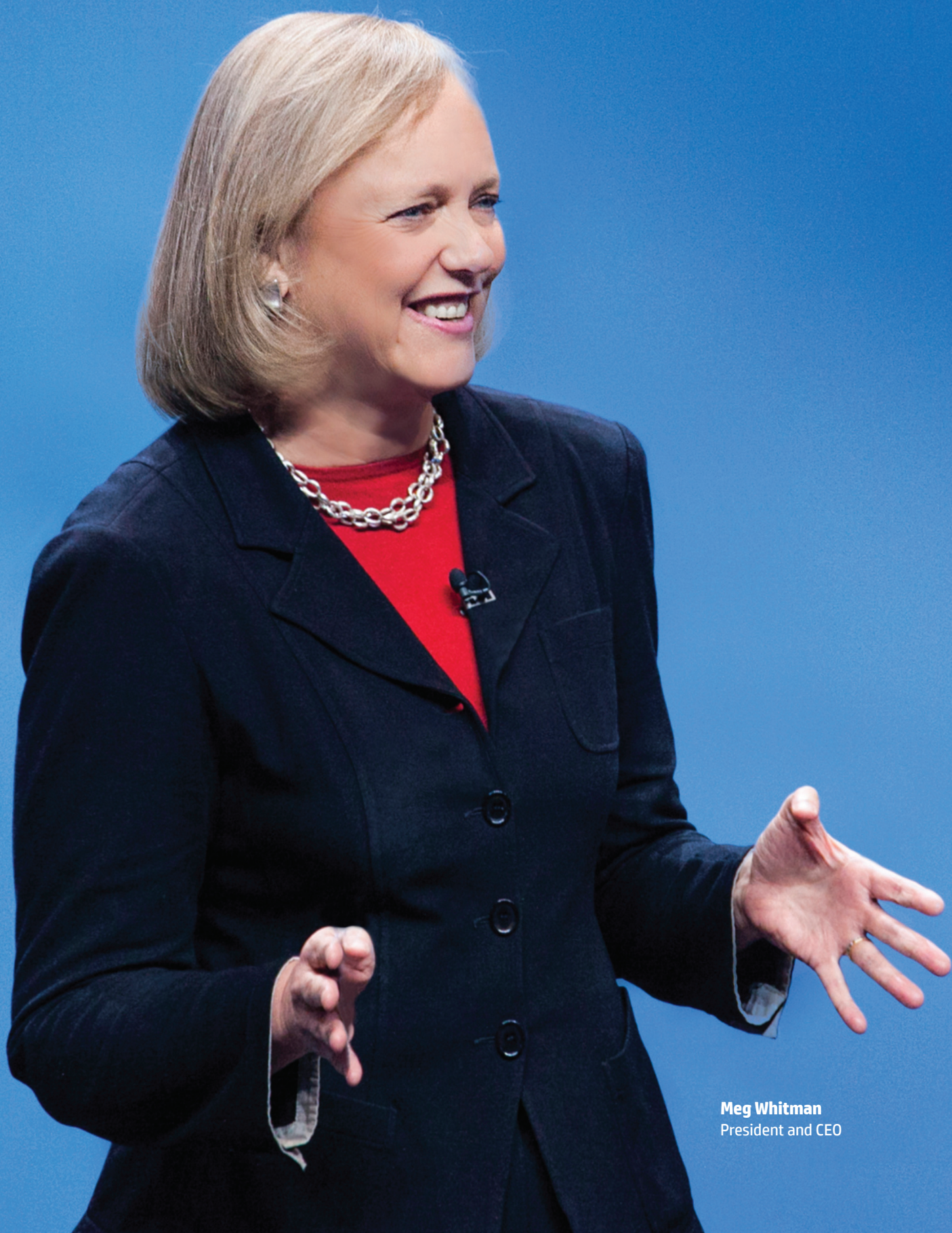
Meg Whitman President and CEO